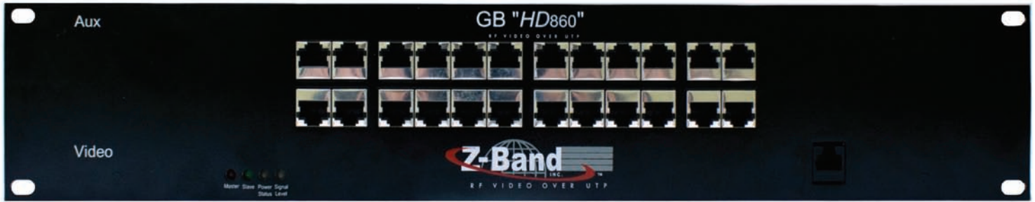
An X20 Media Xpresenter Signage Solution at Banff Centre's New Kinnear Centre for Creativity & Innovation